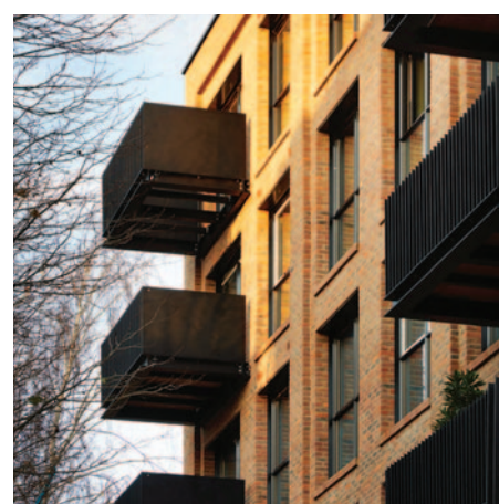
Vabel Lawrence, Seven Sisters

Vabel conceives, delivers and executes developments that outperform markets. Our formula is simple: we leverage our expertise in capital structuring, design and architecture, development management and construction to deliver maximum site value from every development opportunity.